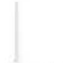
1"×6" Cove Corner MATTE