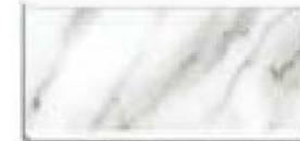
6"×12" Cove Base MATTE